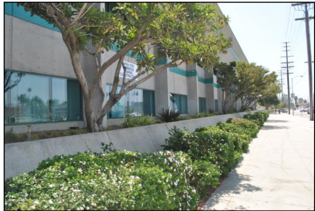
Exterior Windows facing South Main Street