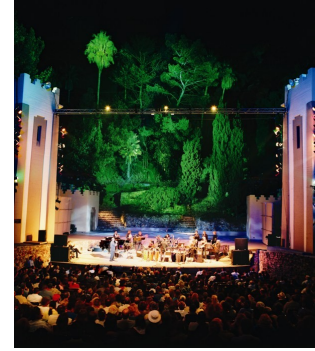
Ford Amphitheatre stage at night

The Arts Commission programs the John Anson Ford Theatres in Hollywood: the 1,200-seat outdoor Ford Amphitheatre and the 87-seat indoor [Inside] the Ford . The Ford Amphitheatre presents 100 events, including music, dance, film, theatre and family fare, each year May through October. The [Inside] the Ford November through April season is devoted to new plays. Most of the events on the Amphitheatre season and all the plays on the [Inside] season are co-presented with Los Angeles County-based arts organizations chosen through a competitive application process. These partnership arts organizations receive free or discounted rent, a season marketing campaign, a tech package, front of house services and technical assistance in the marketing and production areas and the lion's share of box office revenue.