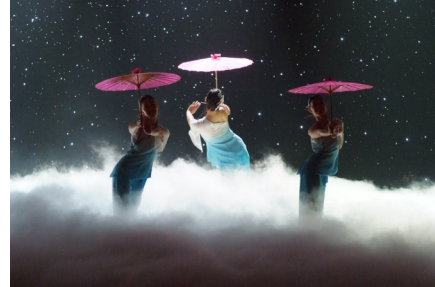
Dream Dance II was among the groups featured in the national broadcast of Holiday Celebration on PBS in 2010.

Each December 24 the Arts Commission produces the L.A. County Holiday Celebration at the Dorothy Chandler Pavilion of the Music Center. The Holiday Celebration celebrated its 51 st anniversary in December 2010. The Los Angeles County Board of Supervisors has sponsored an admission-free holiday-themed show as a gift to the people of the County since 1960. Today, the live presentation, featuring music and dance groups, shows how the myriad cultures of the region mark the holiday season. The largest holiday show in the region, last year drew 5,134 people to the Music Center and 1 million households watched via the live telecast on KCET.