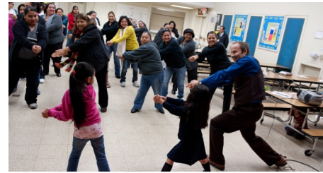
Arts For All Artist Residency program in Montebello school district with Blue Palm

In September 2002, the Los Angeles County Board of Supervisors adopted Arts for All: Los Angeles County Regional Blueprint for Arts Education , a strategic plan to restore arts education — in dance, music, theatre and the visual arts — to the 1.6 million students in Los Angeles County’s 81 school districts. The Arts for All Executive Committee, with more than 100 partners and managed by the Los Angeles County Arts Commission, leads this effort. Starting in 2003-04, Arts for All began inviting districts to participate in the initiative. The Arts Commission provides coaching to the districts to build a strong infrastructure to sustain quality, sequential arts education including a school board-adopted policy, plan and budget as well as the hiring of a district level arts coordinator and a student to credentialed arts teacher ratio no higher than 400:1. As of October 2011 the Arts for All initiative is working with 49 school districts representing 560,465 students. Arts for All coaching assistance to school districts is supported by the Arts for All Pooled Fund, comprised of contributions from the entertainment industry, foundations and corporations and helmed by lead partner Sony Pictures Entertainment. For more information visit www.lacountyartsforall.org .