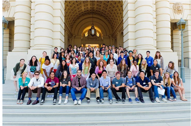
The 2011 L.A. County Arts Interns.

In conjunction with the Getty Foundation, the Arts Commission funds the largest arts internship program in the country. The Commission's program is the performing arts parallel to the Getty's visual arts program. Each summer non-profit performing, literary and municipal arts organizations, using Commission grants, offer paid internships to college undergraduates. The program, which also includes educational components for the interns, is designed to familiarize students with arts administration career opportunities and the arts community as a whole.