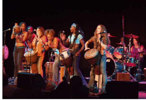
ADAWE is one of the L.A. County music groups available to perform through the free concerts in public sites program.

The Commission produces a year-round music program that funds 40 free concerts each year in public sites such as parks, libraries and community centers. The performing groups are chosen from the Musicians Roster, a directory of Los Angeles County-based music groups from a wide range of genres that has been vetted by a panel of music industry professionals. The roster, accessed through www.lacountyarts.org , incorporates audio and video samples and contact information for the groups and is available to members of the public looking for quality musicians.