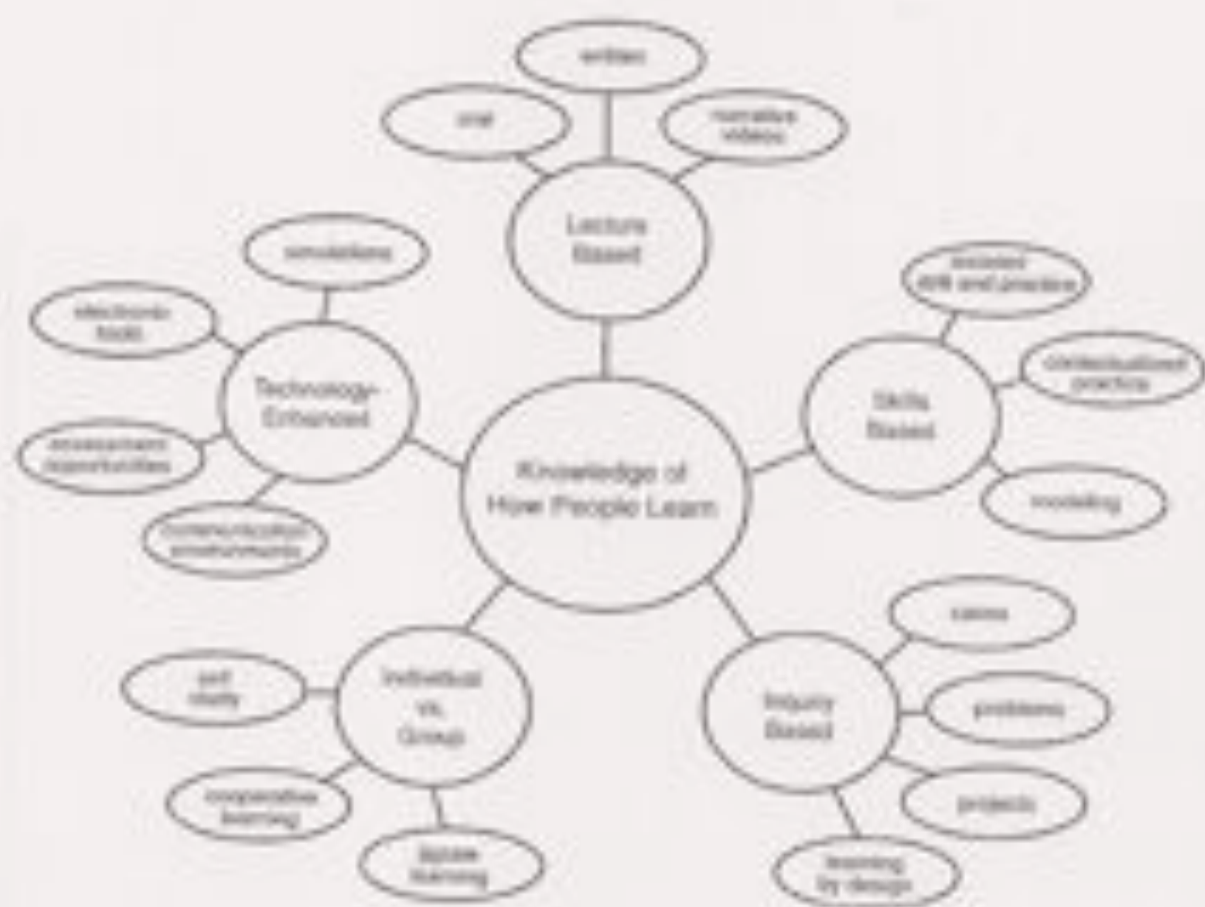
FIGURE 1.1 With knowledge of how people learn, teachers can choose more purposefully among techniques to accomplish specific goals.

around individuals versus cooperative groups, and so forth. Are some of these teaching techniques better than others? Is lecturing a poor way to teach, as many seem to claim? Is cooperative learning effective? Do attempts to use computers (technology-enhanced teaching) help achievement or hurt it?